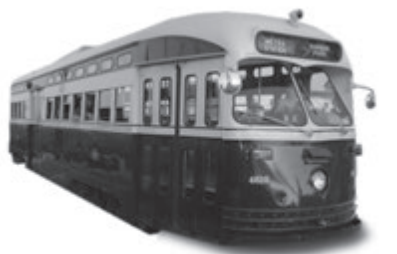
TORONTO Maroon and Cream