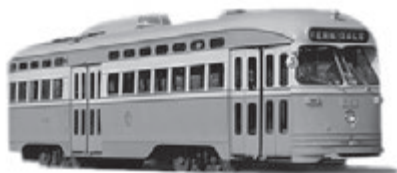
JOHNSTOWN (KENOSHA) Orange

Each Kenosha streetcar has a name and color scheme that represents the legacy of streetcar transportation in North America.