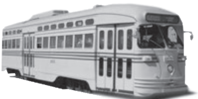
CINCINNATI Yellow and Green