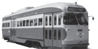
PITTSBURGH Red and Cream